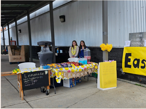
ENTREPRENEUR OF THE YEAR EASY PEASY LEMON SQUEEZY

A big shoutout to all the participants and a special congratulations to our standout lemonade stands of 2024. Your hard work and dedication paid off, and we're incredibly proud of you.