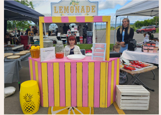
BEST LEMONADE STAND BERRY BLISS LEMONADE