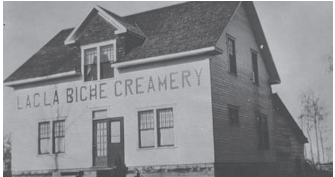
Agri-food is the current buzzword to describe the business local food production and processing but the industry has always been an important part of the Lac La Biche community. This photo is from the early 1930s.